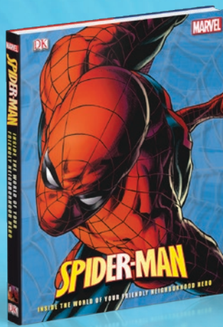
Spider-Man: Inside the World of Your Friendly Neighborhood Hero 9780756690892 | HC 9 x 10 7/8" | 200 pp. | $24.99