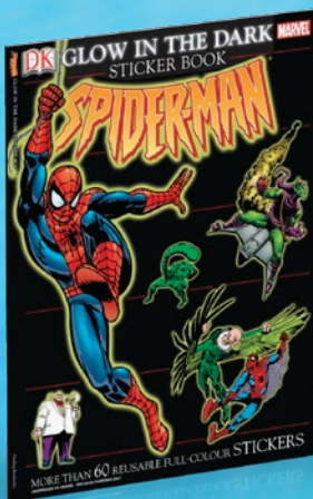
Ultimate Sticker Book: Glow in the Dark: Spider-Man 9780756619992 | PB 8 1/2 x 11" | 16 pp. | $6.99