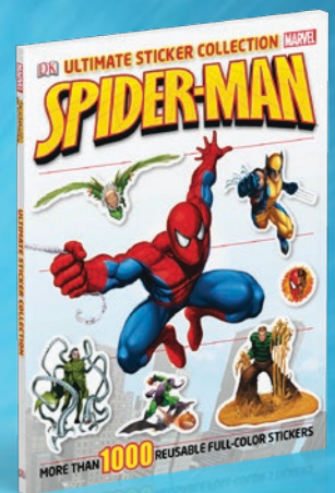
Ultimate Sticker Collection: Spider-Man 9780756690908 | PB 8 1/2 x 11" | 96 pp. | $12.99