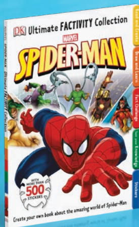
Ultimate Factivity Collection: Spider-Man 9781465416612 | PB 8 1/2 x 11" | 96 pp. | $12.99