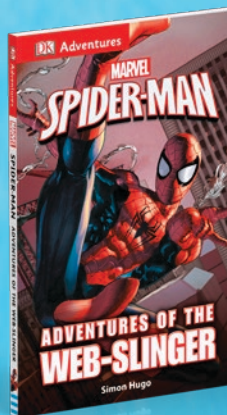
DK Adventures: Marvel's Spider-Man: Adventures of the Web-Slinger 9781465451606 (pb) 9781465451613 (hc) | 5 x 7 3/4" 96 pp. | $5.99 (pb) 16.99 (hc)